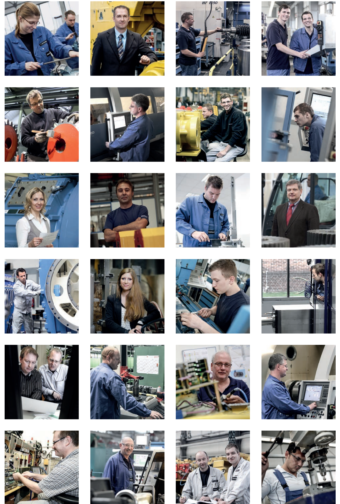
The many faces of Eickhoff: highly committed people are the soul of the company

We also cater for the well-being of our staff. In-house health programmes as well as our own company doctor are just as much a part of what we offer our employees as a varied diet in the company canteen. The result is a satisfied, highly motivated team of employees who we expect a lot from but who are also fostered and encouraged. These factors all go towards explaining why the majority of staff work for Eickhoff for very long periods. In many cases the employer even stays in the family and it is not at all unusual that families remain with Eickhoff over several generations.