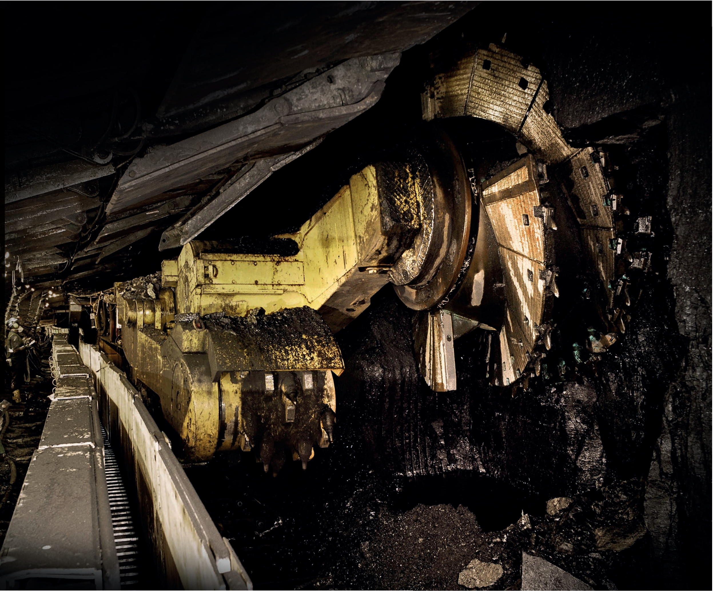
Extremely challenging for both man and machinery: shearer loader SL 500 in action at the Daw Mill Mine, UK

Decades of continual use. Mining machinery, gearboxes and foundry equipment from Eickhoff work reliably and have extremely long service lives – even under highly stressful conditions for both materials and engineering. The fact that we manufacture to the highest quality standards really pays off for our customers. They know they can rely on very low downtimes and outstanding efficiency. Moreover, our production facilities ensure that spare parts will still be available, even decades later.