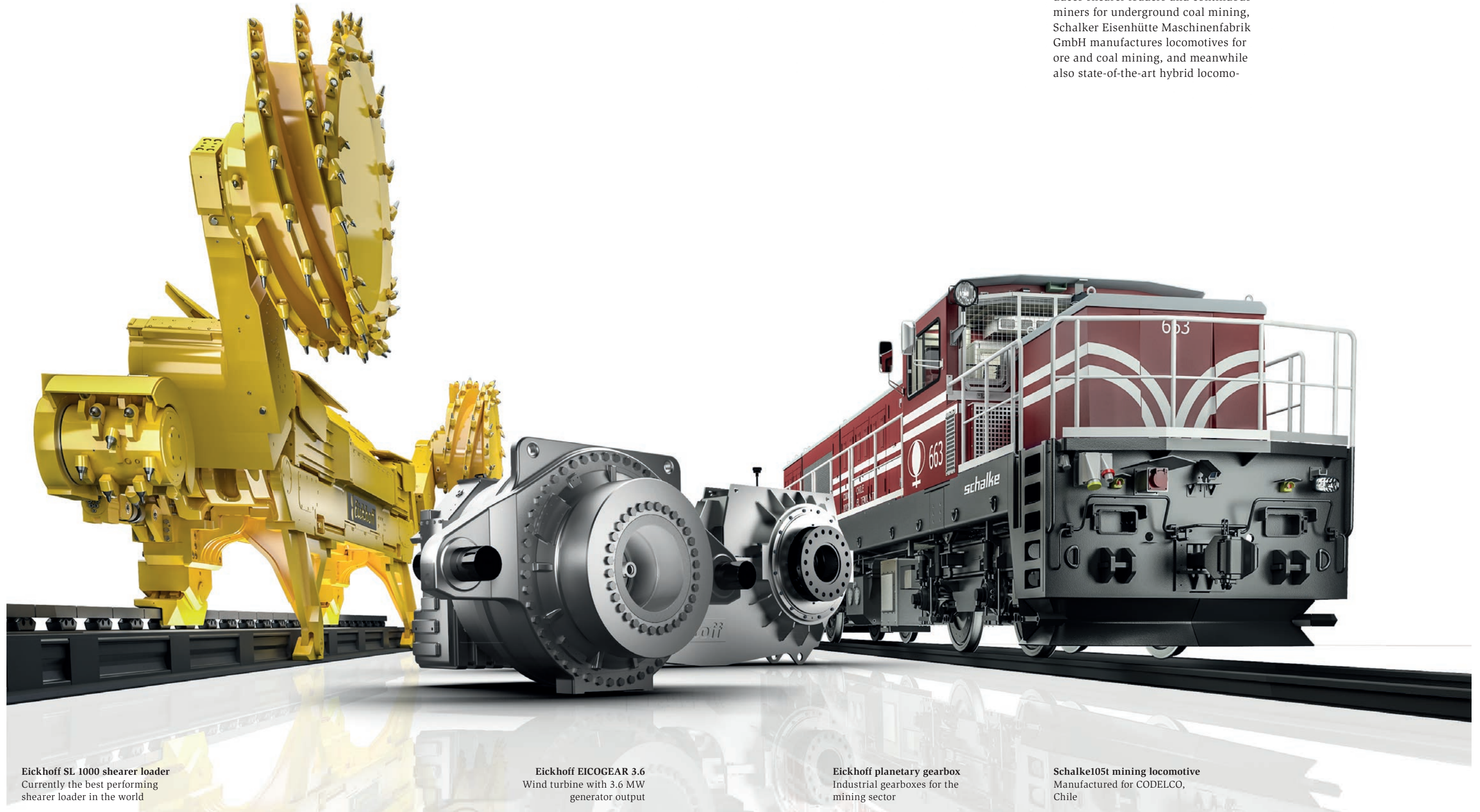
Eickhoff SL 1000 shearer loader Currently the best performing shearer loader in the world

tives for urban underground trains. Eickhoff Antriebstechnik GmbH has entered an important market with the manufacture of gearboxes for wind turbines. Eickhoff Gießerei GmbH and Eickhoff Maschinenfabrik GmbH develop new materials and processes for all areas of our Group that meet the constantly rising standards for contemporary ferrous materials.