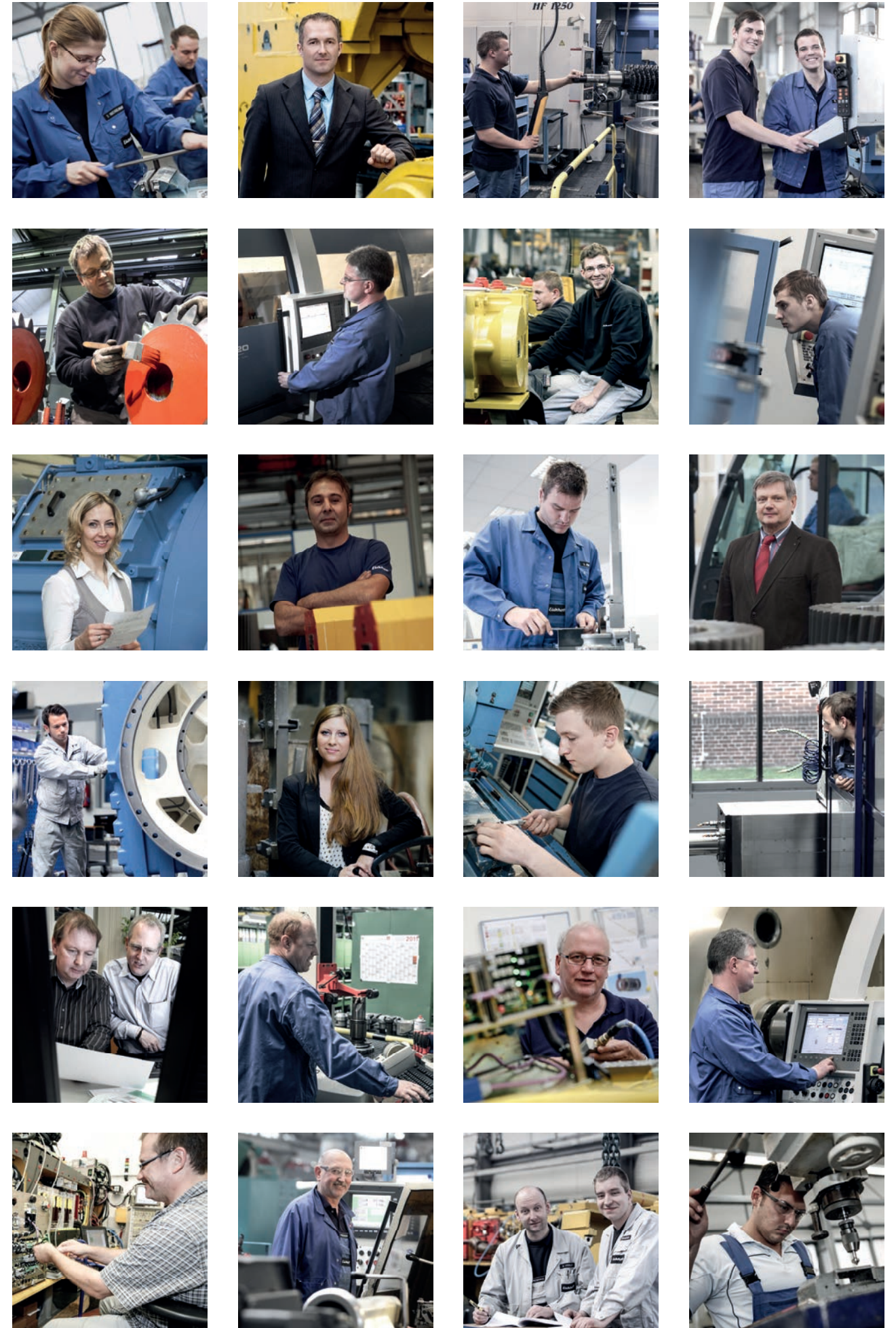
The many faces of Eickhoff: highly committed people are the soul of the company

We also cater for the well-being of our staff. In-house health programmes as well as our own company doctor are just as much a part of what we offer our employees as a varied diet in the company canteen. The result is a satisfied, highly motivated team of employees who we expect a lot from but who are also fostered and encouraged. These factors all go towards explaining why the majority of staff work for Eickhoff for very long periods. In many cases the employer even stays in the family and it is not at all unusual that families remain with Eickhoff over several generations.